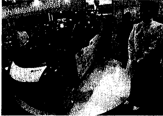
The Mitsubishi i-MiEV, the manufacturer's first electric vehicle, is unveiled at the 9th Auto Expo in New Delhi on Wednesday, January 9, 2008.

Mitsubishi i-MiEV 10 Jan 2008, 0236 hrs IST