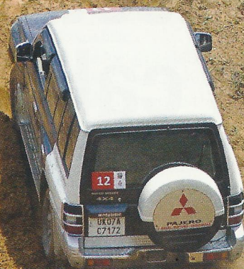
The approximately 40 degree incline which defeated everyone except for three gritty Pajeros

So if you have a Pajero lying around then head to these venues. OD