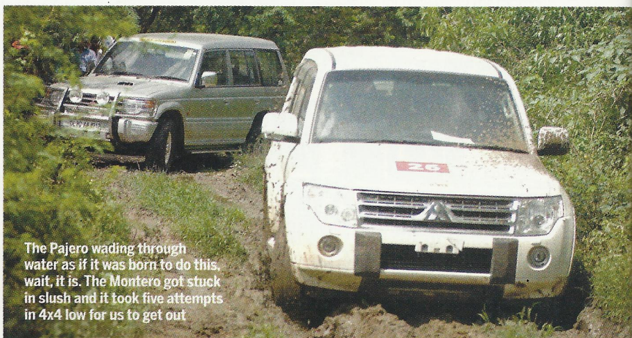
The Pajero wading through water as if it was born to do this, wait, it is. The Montero got stuck in slush and it took five attempts in 4x4 low for us to get out