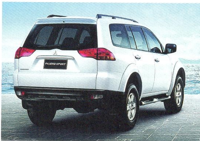
The Pajero Sport might not look very rugged from the rear but with a ladder frame chassis and decent approach and departure angles it is very capable off road

mon rail diesel engine that makes 178bhp and a gutsy 400Nm of torque. It is coupled to a five-speed manual gearbox. We don't expect it to be lightning quick off the line, but driveability and high cruising speeds should come easily to the Sport.